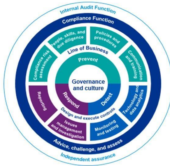
Illustration I: The Compliance Program of Düzey

Prevention is managed through Compliance risk assessments, due diligence practices, written policies, and procedures, communication and trainings. Detection, is supported by technology and data analytics as well as monitoring, testing and audit practices. Response involves investigations and reporting activities.